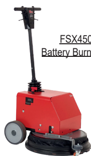
FSX450 Battery Burnisher

for details on the full range of industrial floor cleaning equipment or call our sales office on Tel:0121 706 5771.